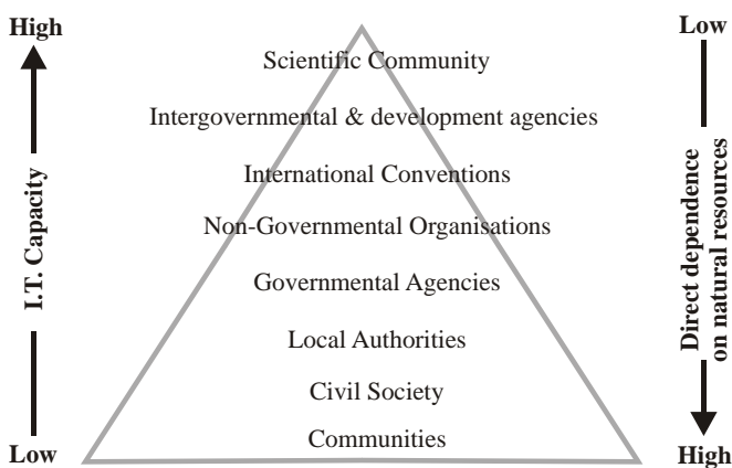
Fig. 3. Stakeholder IT capacity and natural resource dependence